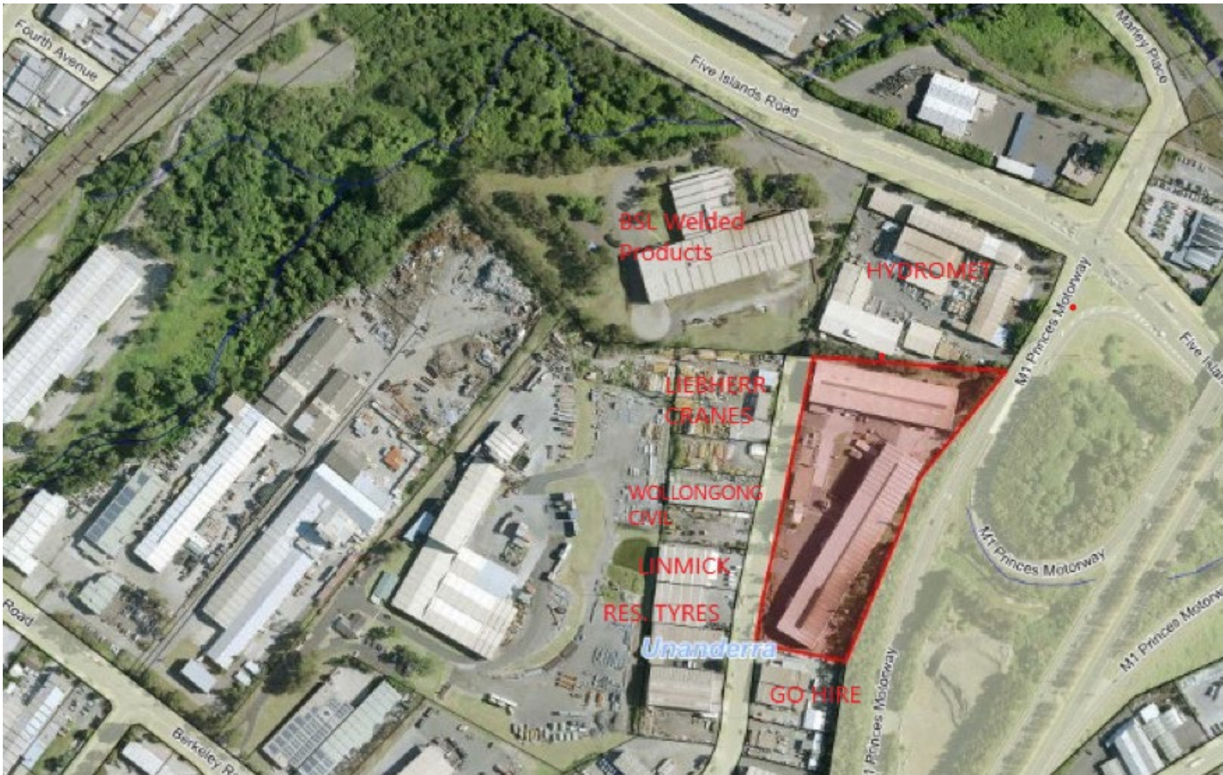
Attachment 2: Bisalloy Neighbouring Properties Map